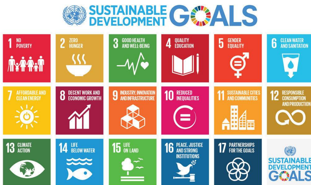
Figure 3. The United Nations Sustainable Development Goals