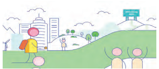
An animation explaining the OECD Learning Compass 2030