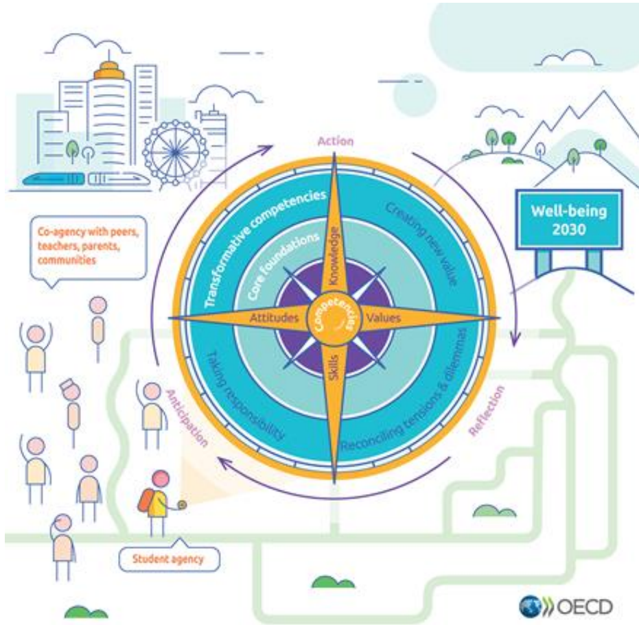
Figure 1. OECD Learning Compass 2030